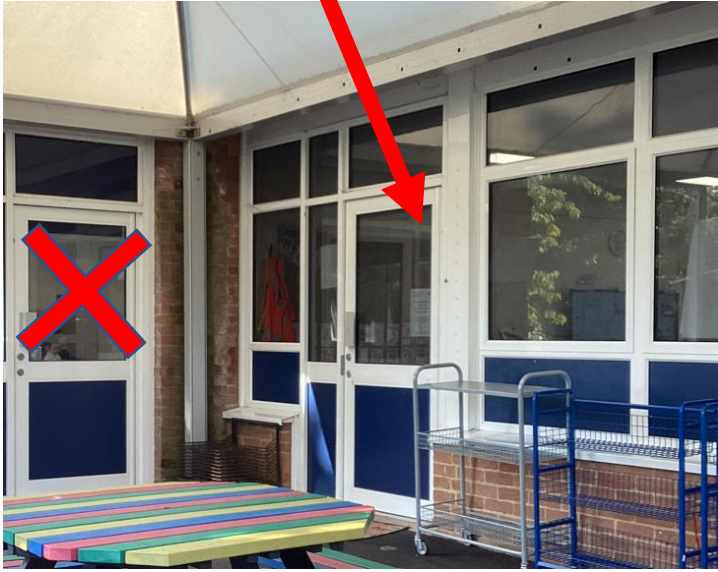
LAVENDER CLASS (Y1 MISS MCNEIL)