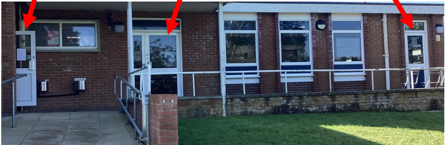
ROBIN CLASS (Y2) (Y1 MISS WATERMAN)

Please wait at the bottom of the ramp on the grass/path for children to be dismissed.