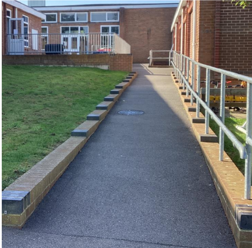
WOODPECKER CLASS (Y2 MISS SHIMWELL)